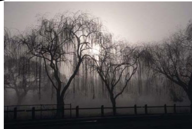
Trees In The Fog